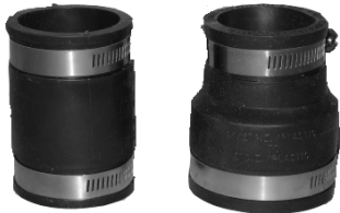
Rubber Hose Couplers (Quantity: 2)

If you are missing any parts contact your reseller