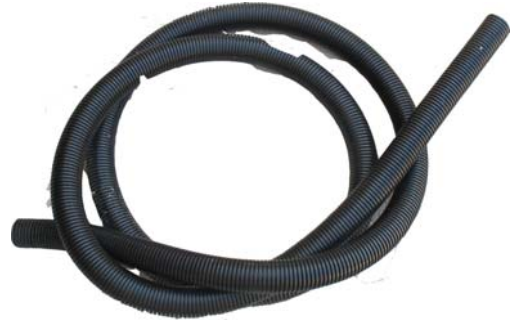
Transfer Hose (Optional)